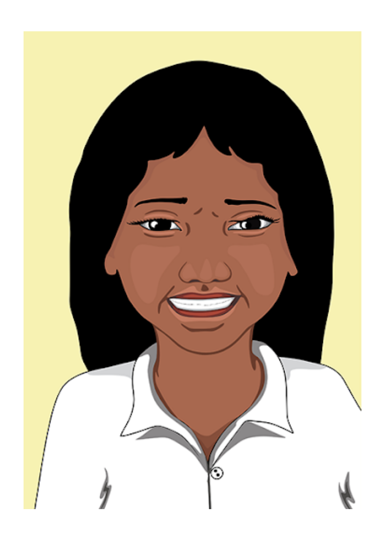
"Should I go?" she wondered. "Yes!" she decided.