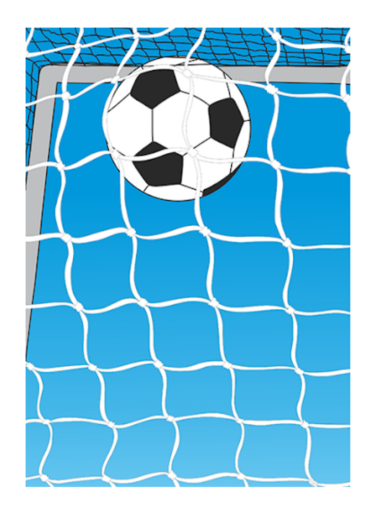
Elsa scored a goal.